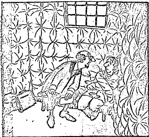
Norrie, Vancouver Sun

As the impact of the initial defeat wore off, the Kits group began to consider alternative strategies. It was at this point that the inherent weaknesses of a transitional neighbourhood movement without a solid base became more apparent. Still, strategically, some of the suggestions adopted made sense. Rather than engage unprepared in a frontal attack against the mental health bureaucracy and its agents, a primitive strategic retreat was made; one that would permit the survival of the group as a working unit and would still permit some fairly close monitoring of the project. Banking on psychiatrist Parfitt's Rooseveltian liberalism and willingness to distribute the crumbs of the participatory democracy pie amongst those 'citizens' still around, members of the Kits group successfully tried to ensure that 'good' people were hired. The operational definition for 'good' in this context was 'unobjectionable liberal'humanists'.