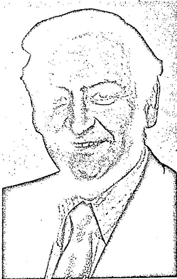
Health Minister Dennis Cocke